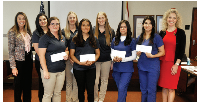
Nursing scholarship recipients

SFSC's health sciences students have received Florida Blue Nursing and Allied Health scholarships since 2006.