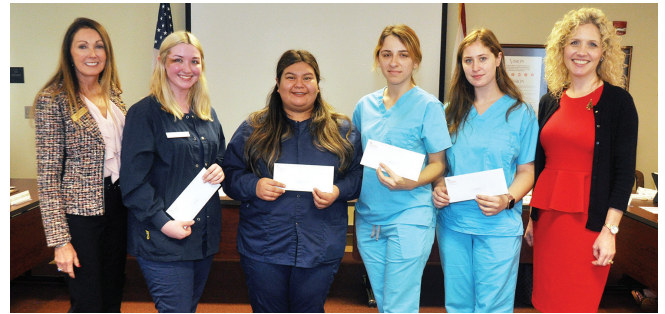
Dental education scholarship recipients