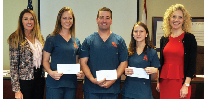
Radiography scholarship recipients