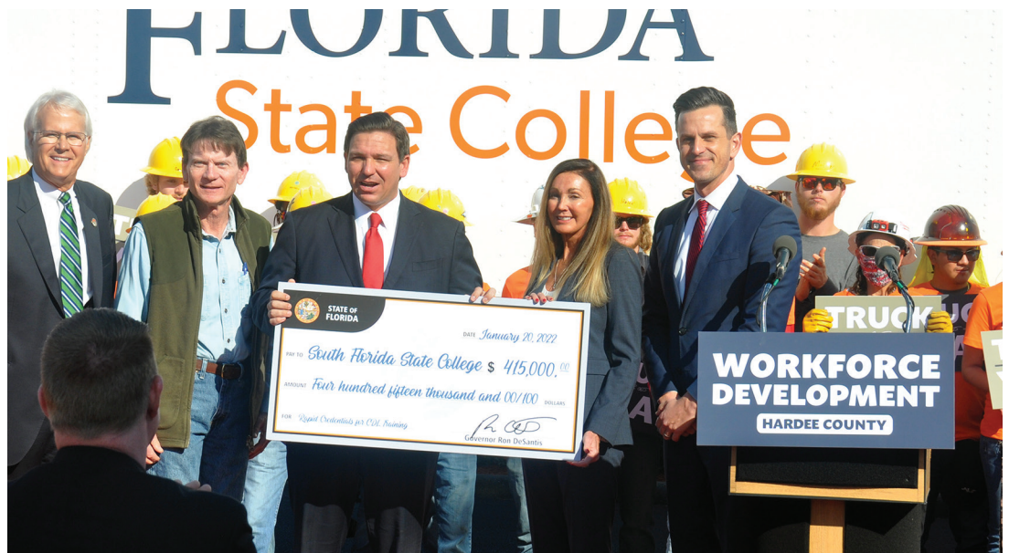
Governor Ron DeSantis touted the importance of workforce development when he visited the SFSC Hardee Campus on Jan. 20.