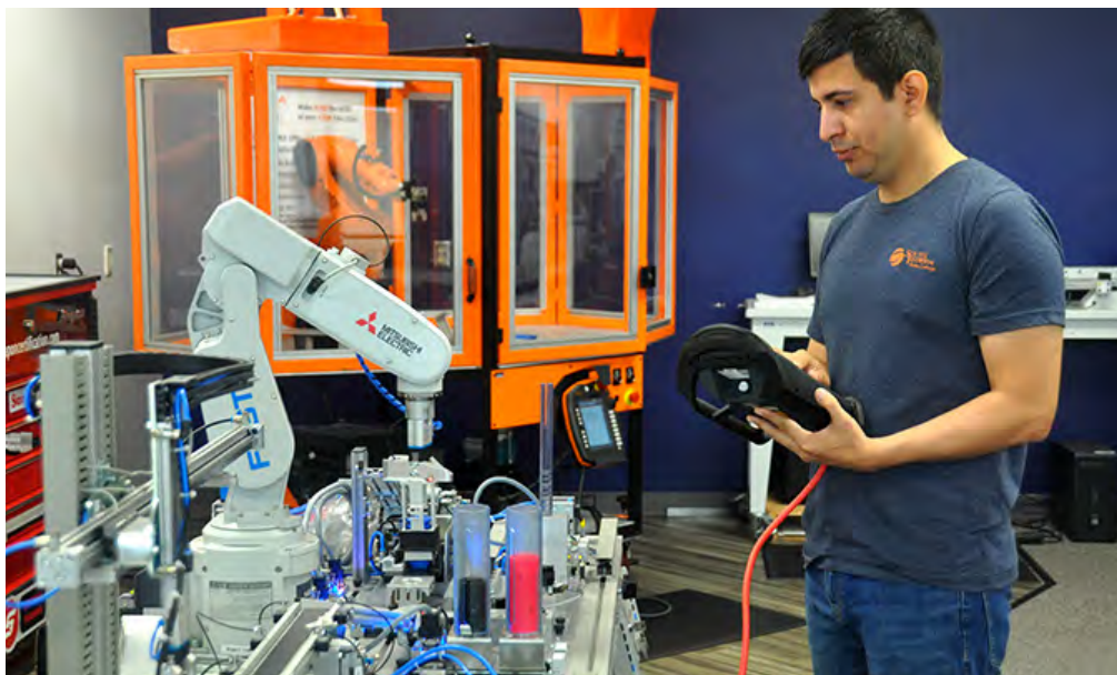
A grant from the National Science Foundation is providing scholarships to students seeking Associate in Science degrees in Engineering Technology.