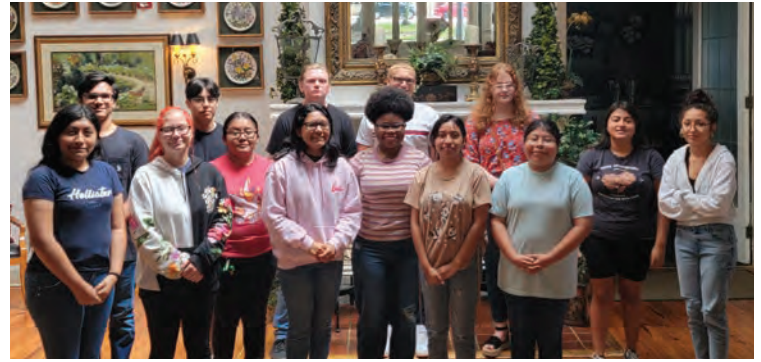
Take Stock in Children scholars received materials that will help them navigate their final year of high school and make the transition to college.

Take Stock in Children is a statewide program that provides at-risk children with a mentor and a college scholarship. In return, Take Stock scholars sign contracts in which they promise to remain drug-free, to avoid behavior that would get them into trouble with law enforcement, to attend school regularly, and to earn satisfactory grades. The SFSC Foundation serves as the lead agency for Take Stock in DeSoto, Hardee, and Highlands counties.