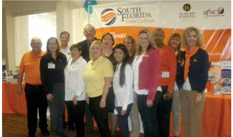
Staff from South Florida State College and the SFSC Foundation attended the Sebring Chamber of Commerce's Business Expo on Oct. 27, held in the Sebring Civic Center.