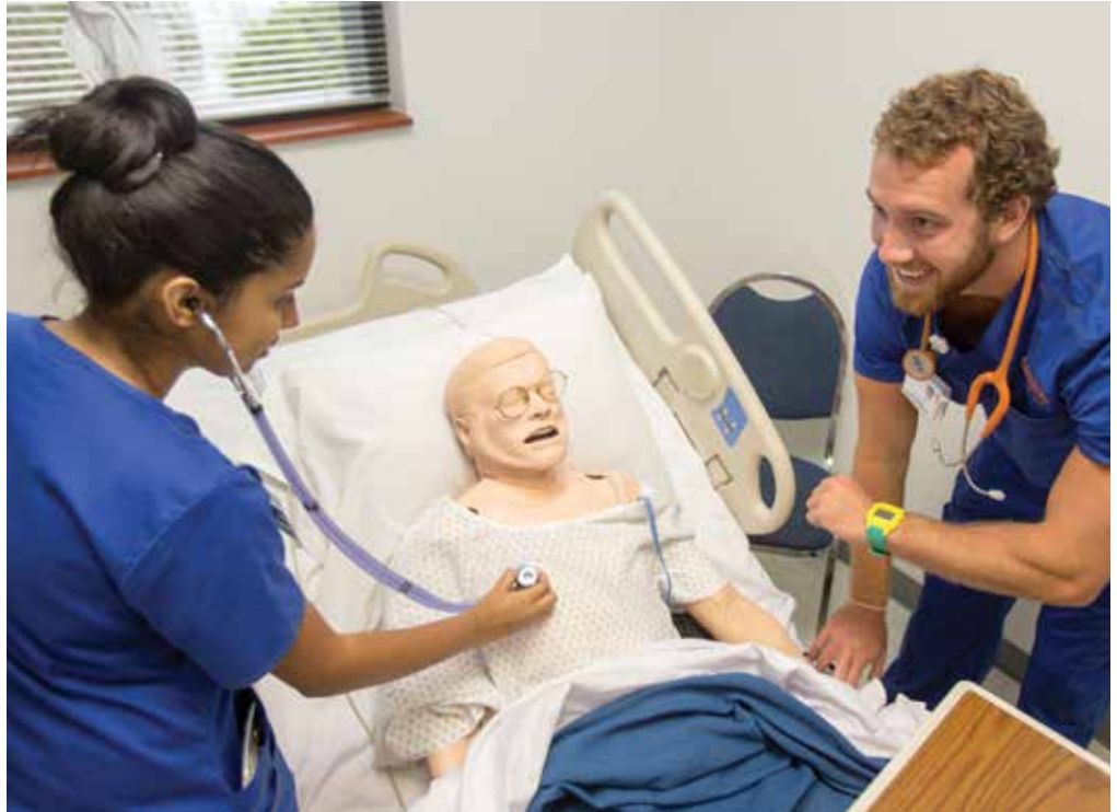
SFSC's Associate Degree in Nursing program enables students to become registered nurses. It is successfully on course to retain its accreditation through the Accreditation Commission for Education in Nursing.

appreciates the work that you do. It was evident from all the meetings conducted throughout our visit that your caring influence reaches far beyond the classroom and is felt by this college and the community.”