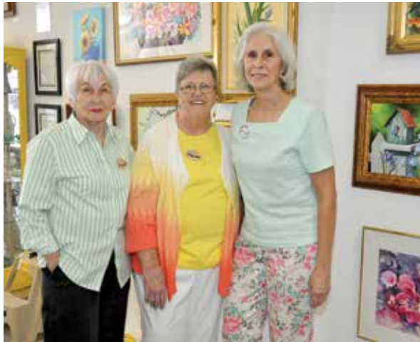
Local artists show and sell their work in The Artists' Group studio.