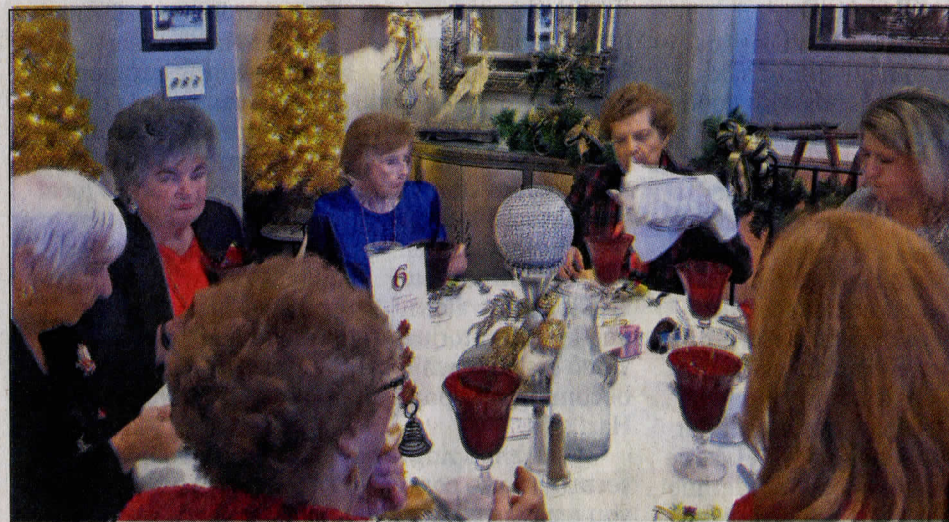
Guests were treated to a delicious lunch in a beautifully decorated dining room at The Hotel Jacaranda.

Guests attending the luncheon were also asked to bring non-perishable items to help support the SFSC Panthers.