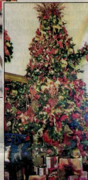
The 15-foot Christmas tree at The Hotel Jacaranda.