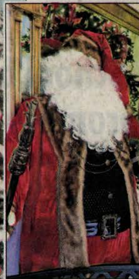
St. Nick at The Hotel Jacaranda in Avon Park.

On a smaller scale, check out the various mini Christmas/