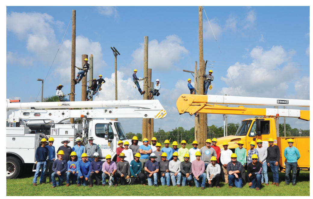
SFSC's Electrical Line Worker Program prepares students to build, maintain, and repair overhead and underground electrical systems.

SFSC's Electrical Lineworker Program prepares students to work as electric line technicians in the construction, maintenance, and repair of electric utility systems. Through 1,500 contact hours of training at the SFSC Hardee Campus, students gain an understanding of electrical systems, operations, and safety while mastering competencies in electrical distribution, basic electrical theory, and underground electrical construction operations. They learn how to maintain electric power systems and use electrical distribution equipment. The program provides practice in climbing, framing, building single and three-phase overhead lines, pole top and bucket rescue techniques, operating bucket trucks, and