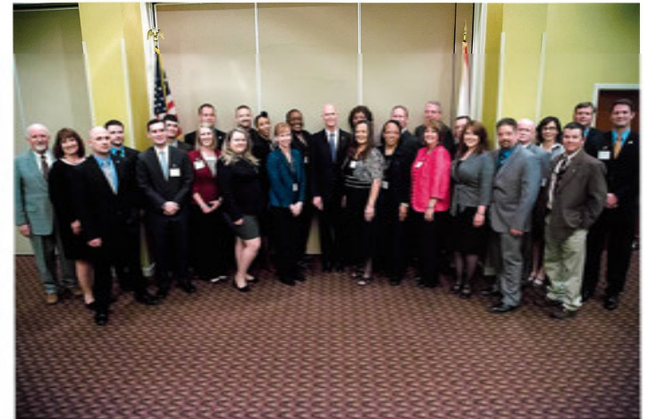
Highlands County Days, March 26, 2013

Drug Free Highlands Reynolds Farms Cornerstone Hospice Self employed - new AG business Lykes Bros. Highlands County Emergency Operation Center South Florida State College Front Porch Dogs Hodges University Cool and Cobb Sherwin Williams Nu-Hope Elder Care Services, Inc. Lykes Bros. Mid Florida Credit Union Highlands Today Highlands Regional Medical Center Heartland Workforce Webber International University School Board of Highlands County Florida Hospital Mason G. Smoak Foundation TD Bank South Florida State College Highlands County Sheriff's Office Client Centricity Highlands County Sheriff's Office Highlands County Clerk of Courts Lykes Bros. Murphy Solutions, Inc.