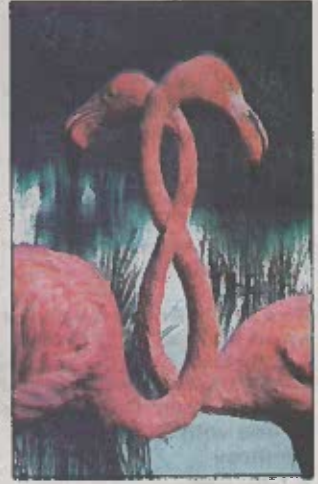
Leavitt featured HCA artist for December Page 9