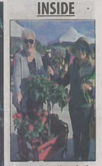
'Let it Grow!' packs in the people Page 8, 14