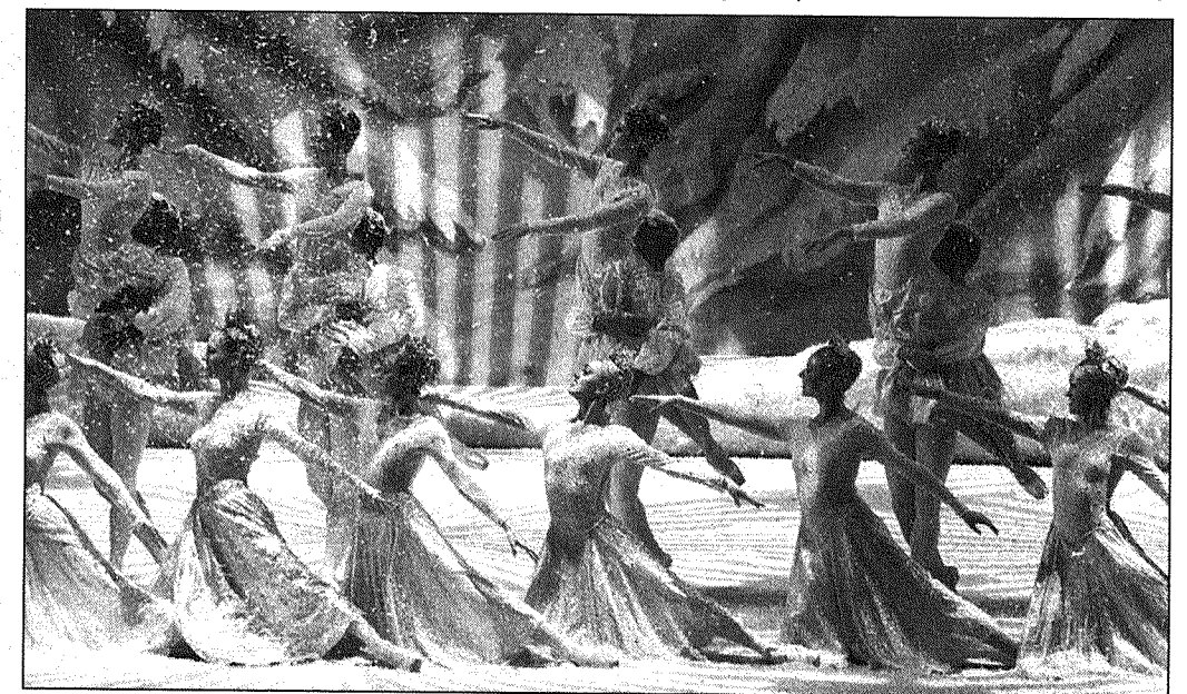
December 1, 2022, The Herald-Advocate B5

The ballet will feature performers from across the Heartland.