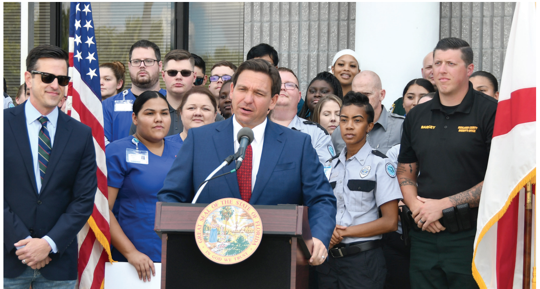
Governor Ron DeSantis visited SFSC in October to deliver funding for the establishment of Critical Workforce Academies in SFSC's service district.