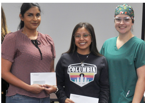
Dental hygiene students accept Florida Blue scholarships.