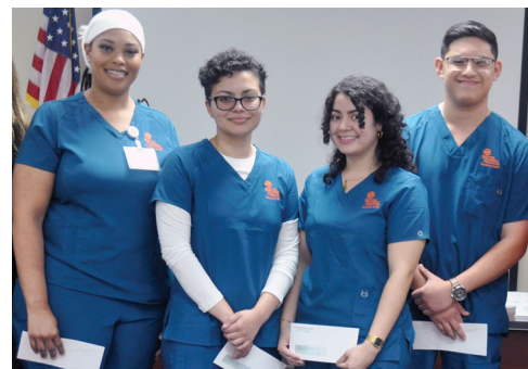
Radiography students accept Florida Blue scholarships.

institutional advancement and external affairs. "Because of its commitment to education and patient care, Florida Blue has provided scholarships to remove financial boundaries for students who will soon begin careers in nursing, dental care, and radiography – all fields that focus on keeping our community safe and healthy."