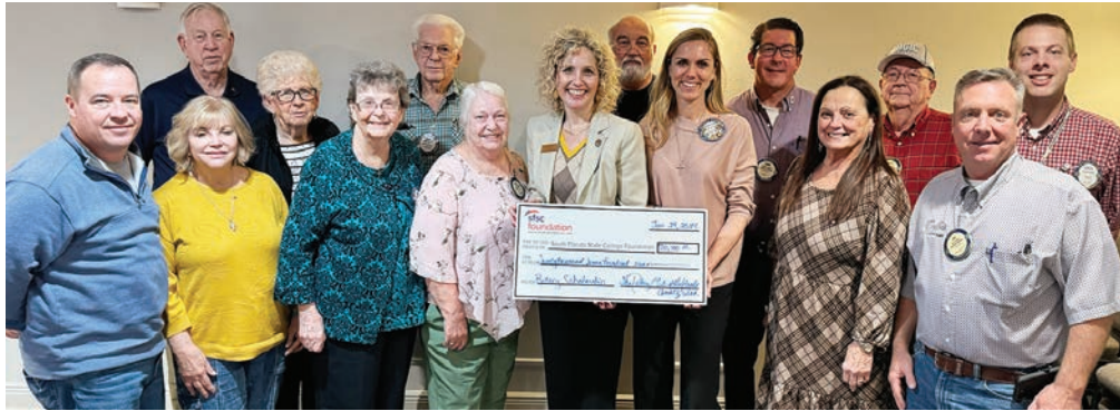
The Rotary Club presents a $20,000 donation for its endowed scholarship.

institutional advancement and external affairs at SFSC. "Their dedication and passion for education and patient care enhance the opportunities available to our students in achieving their goals and impacting our communities."