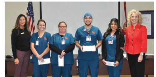
Radiography scholarship recipients