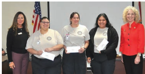
Emergency Medical Services (EMS) scholarship recipients