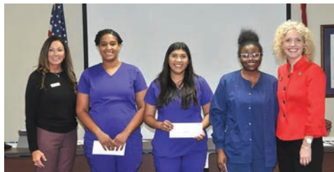
Dental Education scholarship recipients