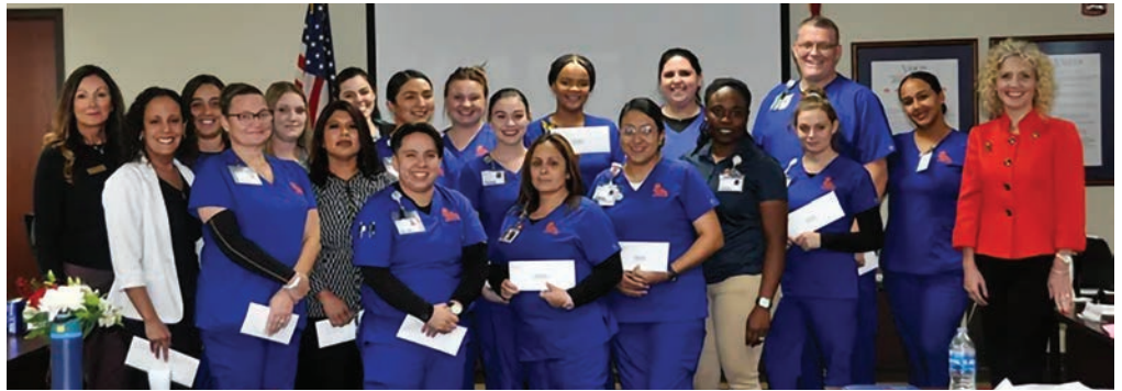
Nursing scholarship recipients

The scholarships are the result of a partnership between the Florida College System (FCS) Foundation and Florida Blue. The Florida Blue Nursing and Allied Health Scholarship was created to