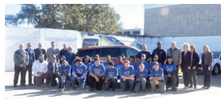
The students and faculty of SFSC's Automotive Service Technology program welcome the new PAW-tomobile.

S FSC students, faculty, and administrators are grateful to New Ford Tech and Bill Jarrett Ford for their donation of a Lincoln Aviator to be used for training future automotive service technicians. We were happy to welcome everyone, including The School Board of Highlands County, on campus for the unveiling of this new training vehicle. Let us know if you see our PAW-tomobile on the road!