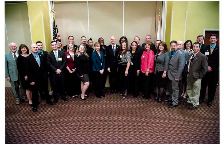
Highlands County Days, March 26, 2013

Drug Free Highlands Reynolds Farms Cornerstone Hospice Self employed - new AG business Lykes Bros. Highlands County Emergency Operation Center South Florida State College Front Porch Dogs Hodges University Cool and Cobb Sherwin Williams Nu-Hope Elder Care Services, Inc. Lykes Bros. Mid Florida Credit Union Highlands Today Highlands Regional Medical Center Heartland Workforce Webber International University School Board of Highlands County Florida Hospital Mason G. Smoak Foundation TD Bank South Florida State College Highlands County Sheriff's Office Client Centricity Highlands County Sheriff's Office Highlands County Clerk of Courts Lykes Bros. Murphy Solutions, Inc.