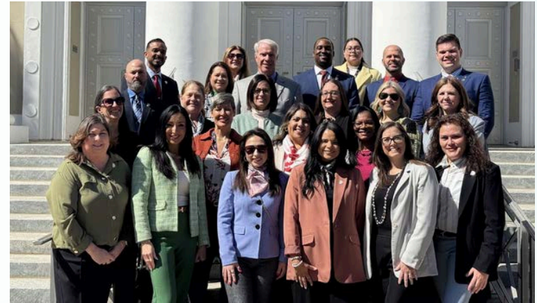
Class of 2026 Florida Supreme Court

Highlands County Clerk of Courts Sun 'n Lake of Sebring Improvement District Highlands County Supervisor of Elections Brooke Britt Insurance Agency Inc Farm Credit of Florida South Florida State College AdventHealth Sebring Highlands County Board of County Commissioners Highlands County Board of County Commissioners AdventHealth Sebring Highlands County Board of County Commissioners South Florida State College The School Board of Highlands County Allstate/Hartline Insurance Inc South Florida State College Sunshine Staffing HCA Florida Highlands Hospital SouthState Bank Highlands Soil and Water Conservation District MIDFLORIDA Credit Union Champion For Children Foundation IOU Health Exchange The School Board of Highlands County Highlands County Fair Association Boys & Girls Club of Highlands County City of Sebring KORE Wireless Bank of America Merrill Highlands County Sheriff's Office